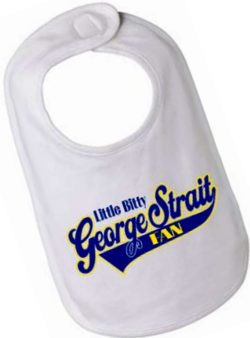
5215 Baby Bib