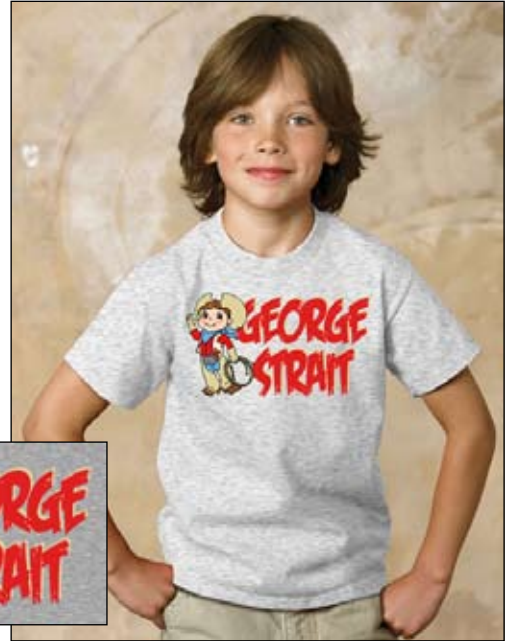
5255 Youth Cowboy Tee