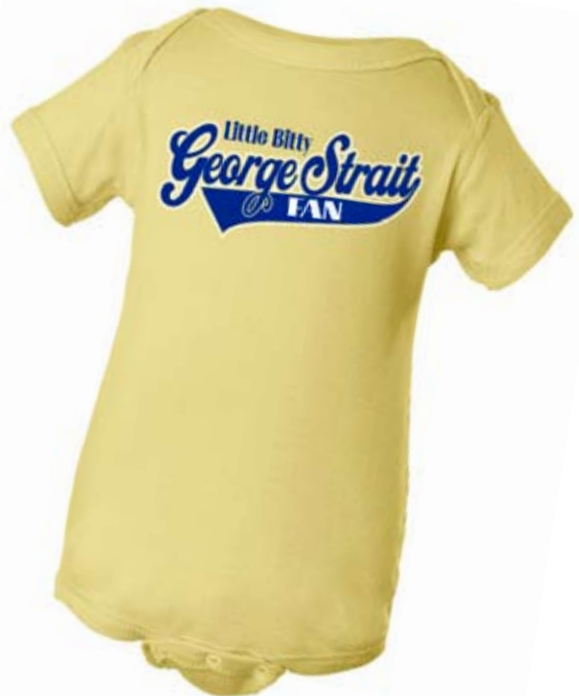
5230 Baby Onesie/Creeper