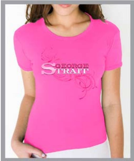
3810 Ladies Azalea Pink Short Sleeve Tee