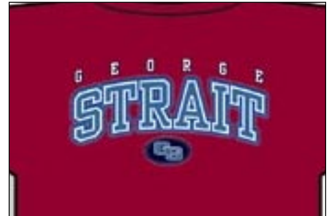
Artwork featured on: #9006 New Burgundy T-Shirt (shown) and #9006 New Navy Sweatshirt