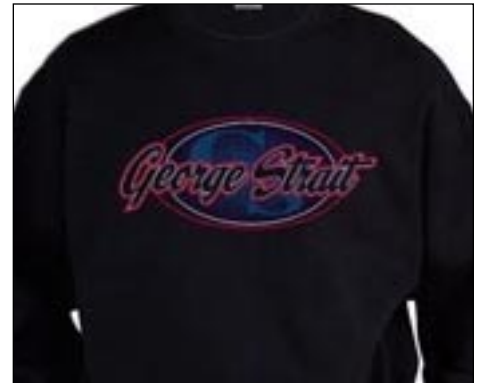
#9008 New Black Sweatshirt