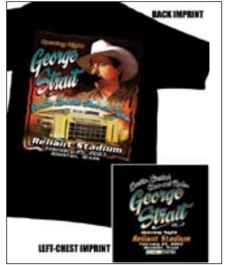
#5007 - Commemorative T-Shirt