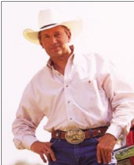
#217 New Color George Strait 8x10 Photo (see Merchandise Order Form)

A live performance DVD of the same name with three additional songs will be released on February 25th. It is Strait's