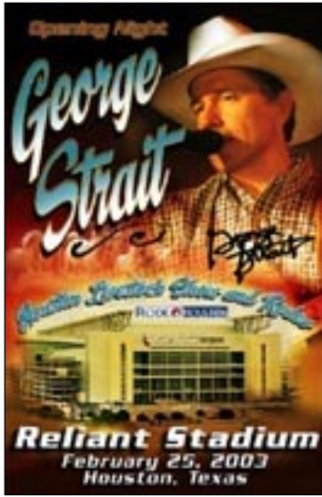
#615 - Commemorative Poster