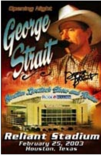
#615 - Commemorative Poster