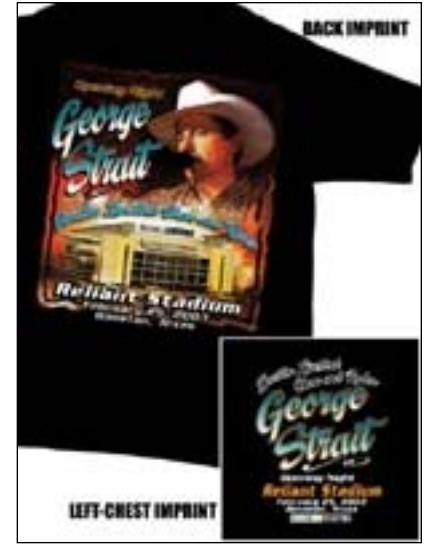
#5007 - Commemorative T-Shirt