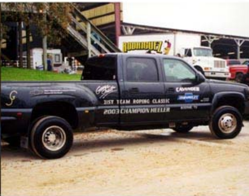
Chevy Dually DuraMax diesel truck furnished by CAVENDER Chevrolet.