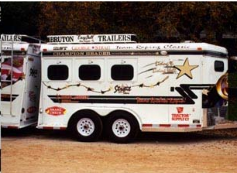
Bruton Strait Extreme 3-Horse Slant Trailer furnished by Tractor Supply Co.