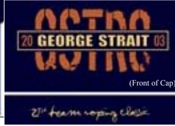
(Front of Cap)