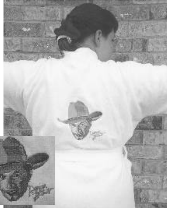
#6700 - Bathrobe