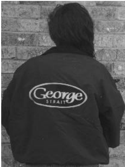
#9990 - Tour Jacket