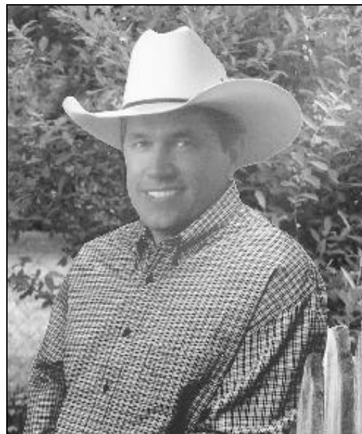
#245 - George Strait Stand Up (Close Up)