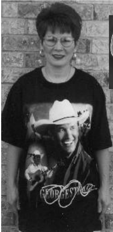
#5008 - Tour T-Shirt (Front)