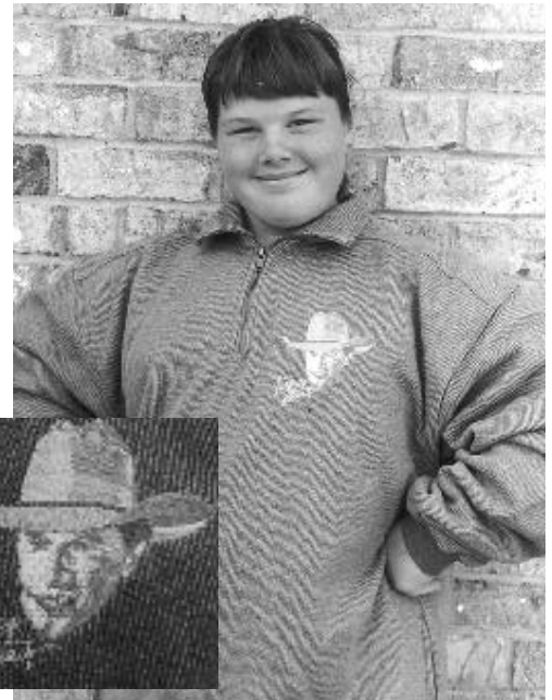
#9006 Zip Up Sweatshirt