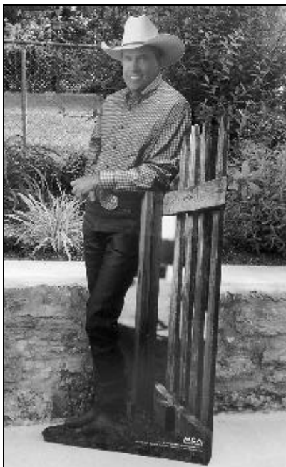
#245 - George Strait Stand Up

For the first time, The George Strait Fan Club is happy to offer a full life-size tandup of George Strait. The cardboard tandup is in full color and when open tands a good six feet in height. The beautiful four-color piece is a photograph of George leaning on an old weathered wood-d fence. The Stand Up was designed by MCA Records and is the same as will be seen in Record Shops across the country. To order, please use the order form below. If using a MasterCard/Visa, you may order by calling the toll free number -800-338-4732 and ask for item number 245.