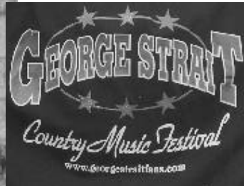
#5008 - Tour T-Shirt (Back)