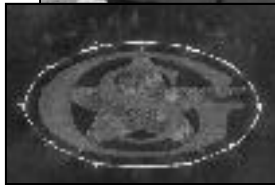
Above: Front View of Jacket