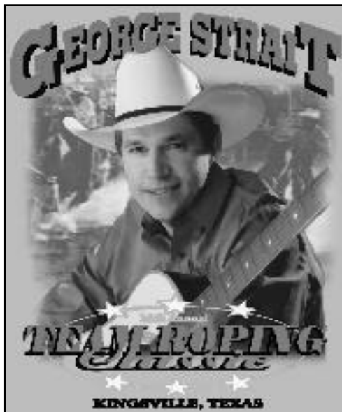
#5099 Team Roping T-Shirt - Front

The 1998 T-shirts and caps for the 16th annual George Strait Team Roping Classic are available now as a limited edition item from the George Strait Fan Club. The shirts and caps are zipping now to members who would like to have them but were unable to make the trip to Kingsville, Texas for the event or would like additional items. The T-shirt features a new design on the front with 1998 on the back while the embroidered cap is also a new design. The T-shirt sells for $20 each plus $4 for shipping and handling. The embroidered caps are $17 plus $3 for shipping and handling. Neither the cap or T-shirt are regular catalog items and must be special ordered. The T-shirt is a safari green with a very colorful design (pictured). The items may also be seen by checking out our website at www.georgestraitfans.com . Both items are ready for shipping immediately. To order using your MasterCard or Visa, please call our Toll Free Number at 1-800-338-GSFC using the order numbers listed below.