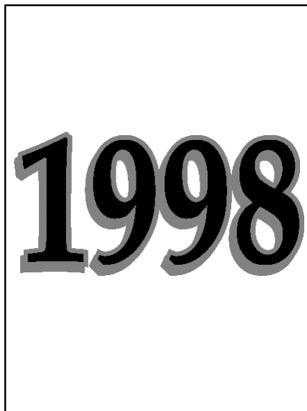
#5099 Team Roping T-Shirt - Back