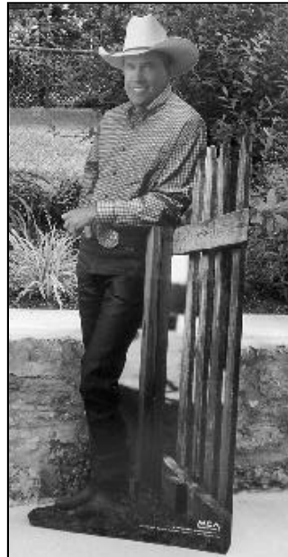
#245 - George Strait Stand Up

The George Strait Fan Club is happy to offer a full life-size standup of George Strait. The cardboard standup is in full color and when open stands a good six feet in height. The beautiful four-color piece is a photograph of George leaning on an old weathered wooded fence. The Stand Up was designed by MCA Records and is the same as will be seen in Record Shops across the country.